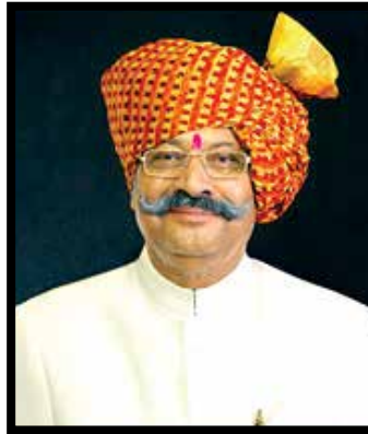
His Excellency Shri. Srinivas Patil The Governor of Sikkim