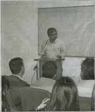
views on existing Indian economy and its development were appreciated and well received by students and faculty members who attended the lecture. The release adds